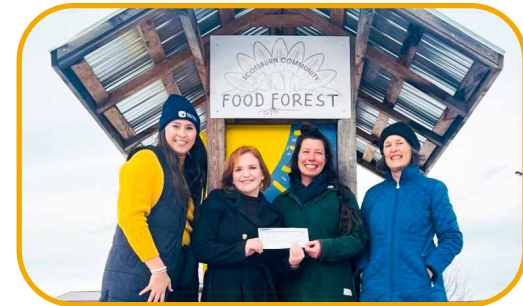
Staff visit Scotsburn Community Food Forest