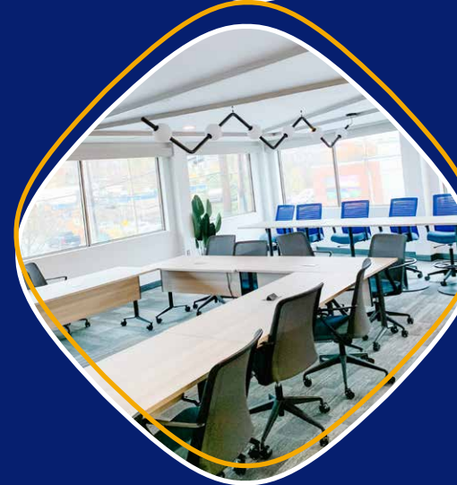
The East Coast Community Corner provides a space for community collaboration and growth

East Coast CU demonstrates its deep commitment to community by opening the East Coast Community Corner Space on the second floor to nonprofit member organizations in Antigonish. By providing a welcoming, accessible place to gather, collaborate, and build capacity, the credit union helps strengthen the social fabric of our community. In 2025, East Coast CU donated over 500 hours of meeting space to 19 community groups , supporting important local work and fostering connection. Organizations such as Antigonish Rivers Association, Antigonish Women's Centre, Settlement in Antigonish for Families From Everywhere, Celtic Homes, Naomi Society and L'Arche Antigonish are just a few examples of the nonprofits that have benefited from this shared space, reflecting East Coast CU's belief that strong communities grow when people are given room to come together.