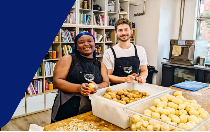
Our staff participate weekly in the Waste Not Want Not program to transform surplus food into community meals and reduced emissions