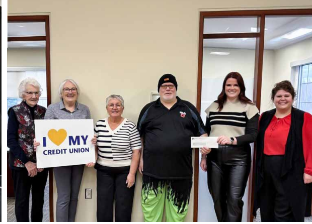
Our Mabou branch proudly supported the Mabou Seniors Club annual bus trip during our #EastCoastCUCares program