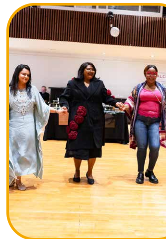
Celebrating inclusive fashion at the Beyond the Runway showcase by Celebrate Your Curves 2