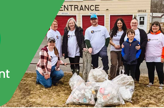
LaHave location community clean-up for 2025 Earth Day