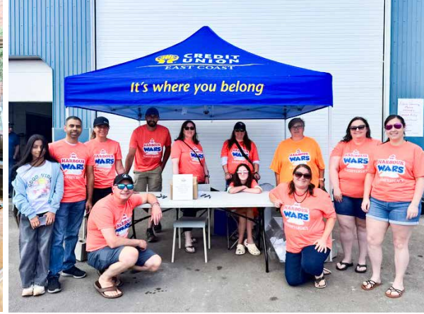
Our staff fundraising at the 2025 Harbour Wars to support cancer care in Cape Breton