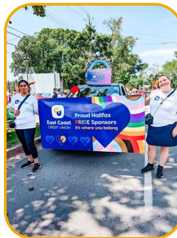
Pictured here and above in heart: Staff coming together for the Pride parade in Halifax

As part of our ongoing commitment to building a workplace culture rooted in inclusion, safety and accountability, we recognized the need for human-centered tools to help teams manage complex interactions. Bystander intervention training, offered by P4G, gave staff the skills to identify overt and subtle inappropriate behavior. Trust, empathy, and service excellence are essential to our sector, and these skills directly strengthen team relationships and member experience. The training has helped foster a more supportive and accountable workplace.