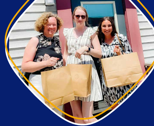
#Loyal2Local is a month-long initiative that invests in our communities by encouraging staff and board members to shop local

At East Coast CU, we know the value of small and medium-sized businesses to our community. It's part of the foundation of our credit union. One way we demonstrate our appreciation of these businesses is through the Loyal 2 Local challenge. Through funds from Atlantic Central and matched by East Coast Credit Union, our staff and board members had $50 to spend at local businesses last summer. The result: $24,000 invested back into the local economy. From restaurants and neighbourhood coffee shops to boutiques to farmer's markets, East Coast CU's Loyal 2 Local spending is an intentional way to inject more into our local economies.