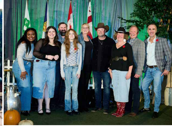
Staff supporting 4H Nova Scotia at the 2025 Rooted Gala