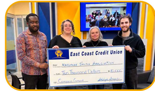
Cheque presentation to Margaree Salmon Association