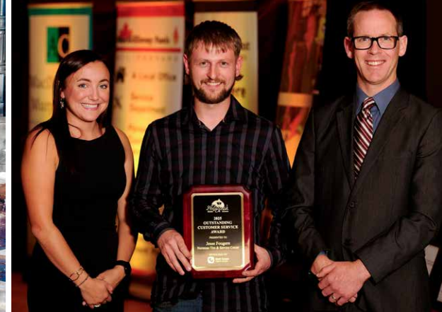
East Coast CU staff presenting an outstanding customer service award at the Antigonish Chamber of Commerce