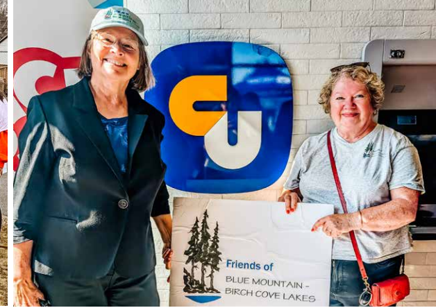
Supporting local trails with a $2,500 donation to Friends of Blue Mountain Birch Cove Lakes at our West Bedford grand opening