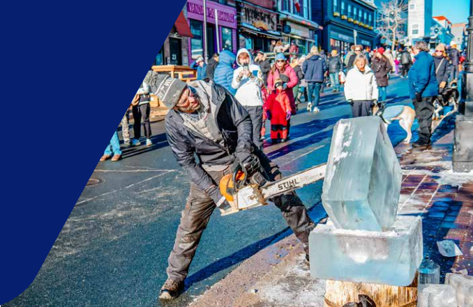
The East Coast CU Ice Festival helped drive heavy foot traffic and support local businesses in Downtown Dartmouth