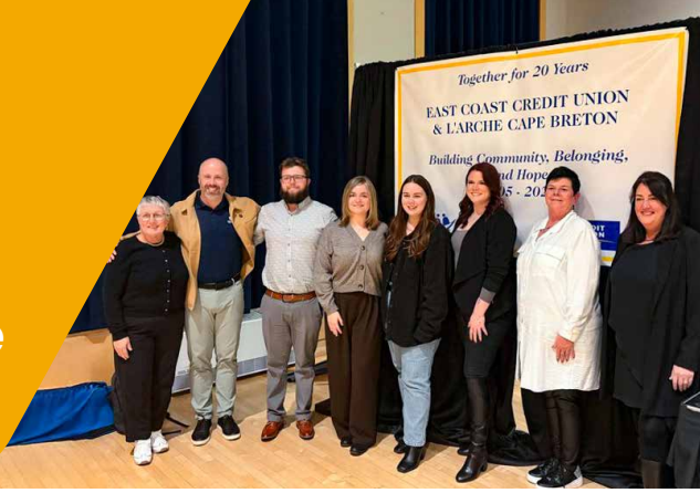
East Coast CU Proudly celebrates 20 years of partnership with L'Arche Cape Breton