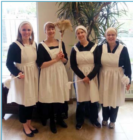
☀ Staff help out with the 2015 Downtown Dartmouth Clean-up