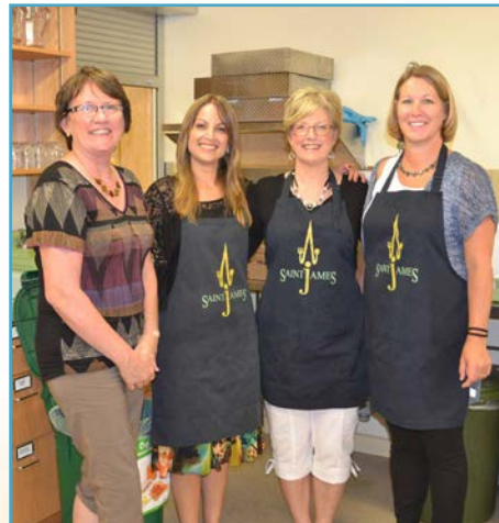
☀ A team of Antigonish branch staff make and serve lunch every 7 weeks for the those in need of a hot lunch in the community.