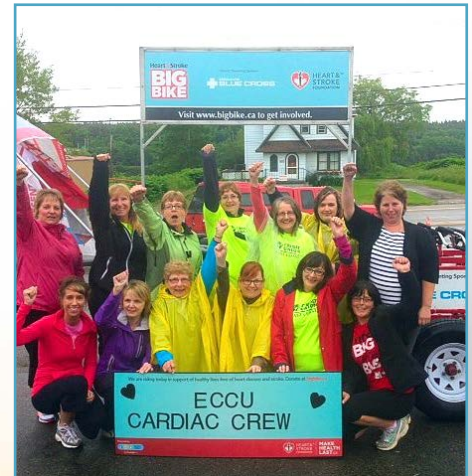
☀ The Port Hawkesbury team again participated in the Heart and Stroke Big Bike Ride this year. The "ECCU Cardiac Crew" raised $958.00!-